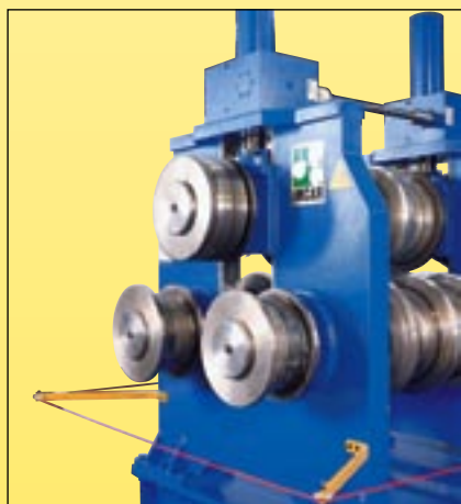
Set rulli per curvatura profili UNP Special rolls to bend UNP profile

The Guard-rail bending machine is capable to bend sections with 2 and 3 waves, outside and inside wing.