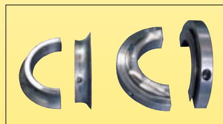
Attrezzature per 2 onde 2 waves tools